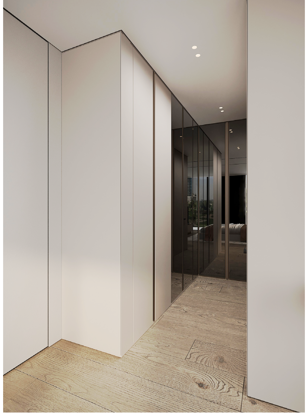
MASTER BEDROOM - 1