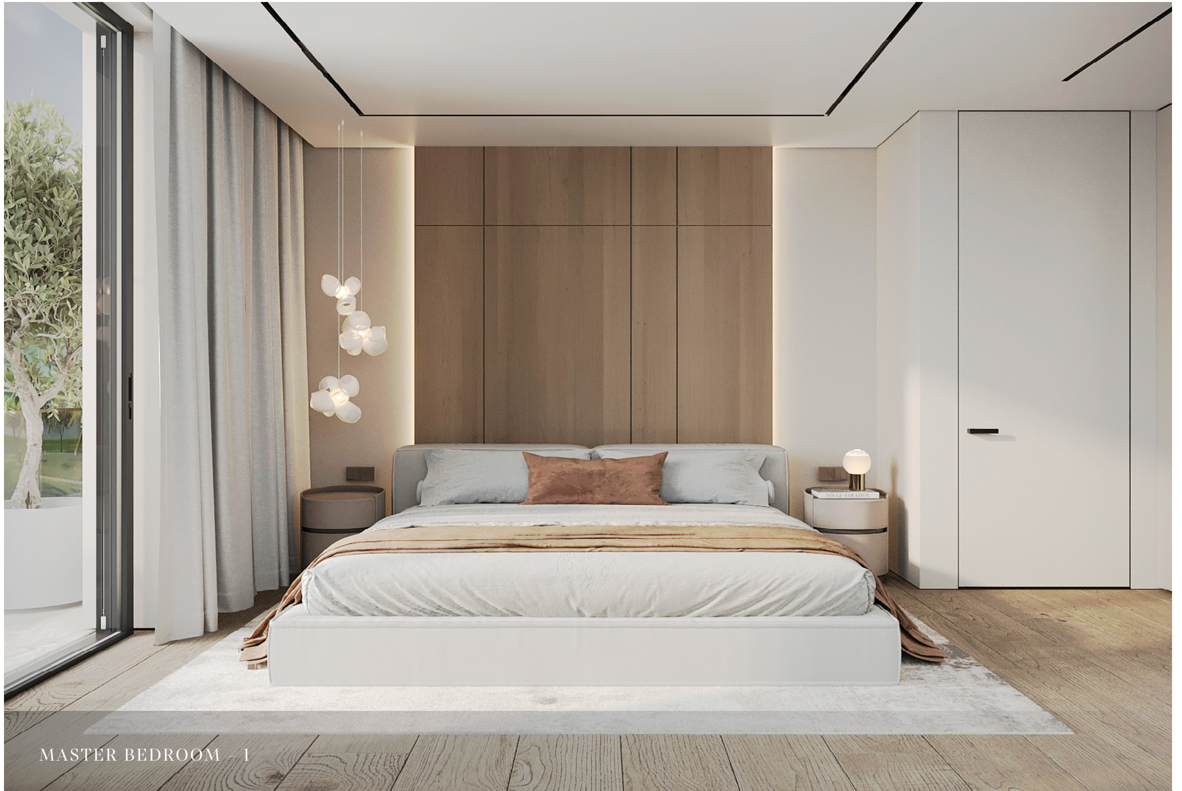
MASTER BEDROOM - 1