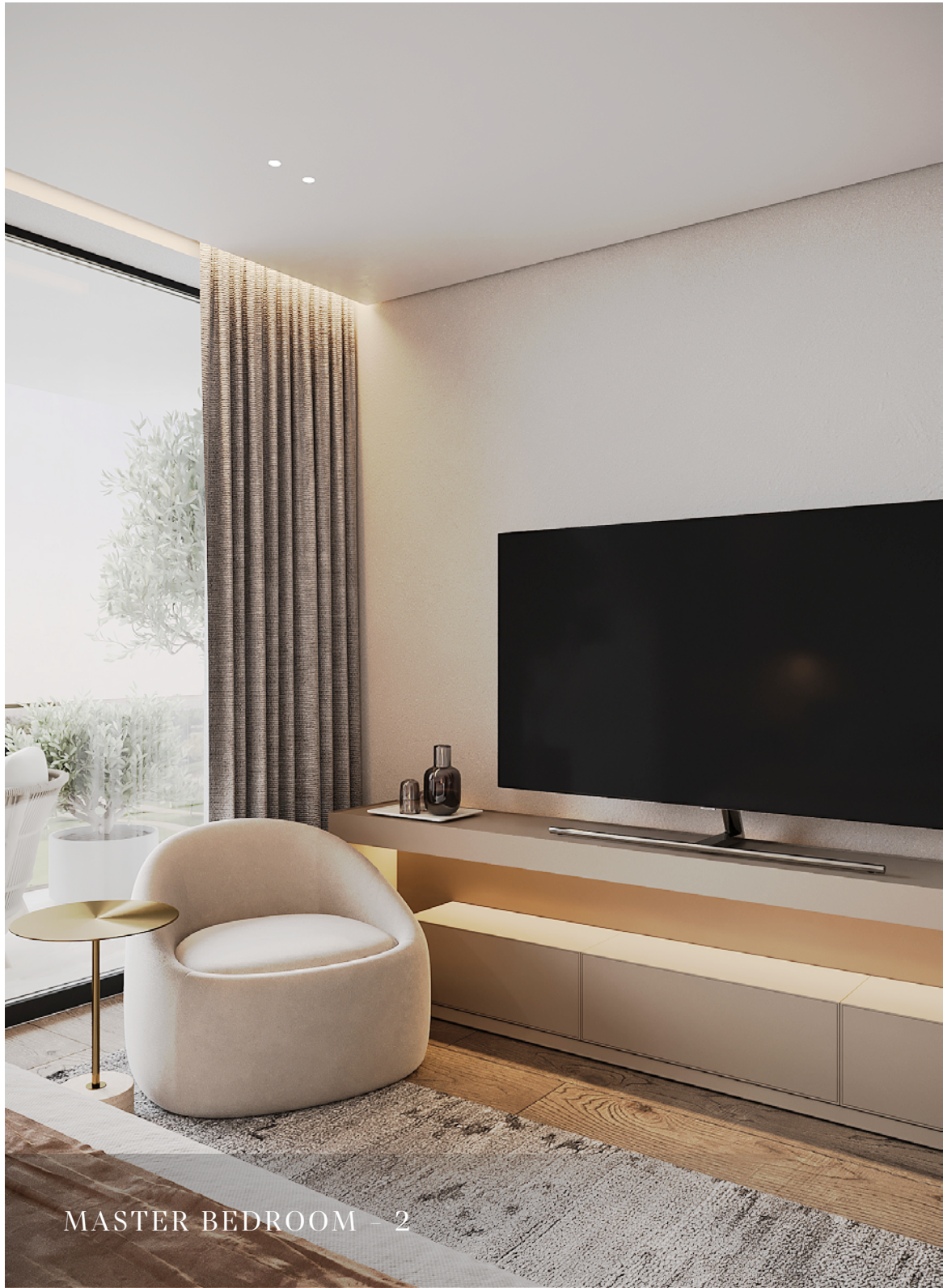
MASTER BEDROOM - 2