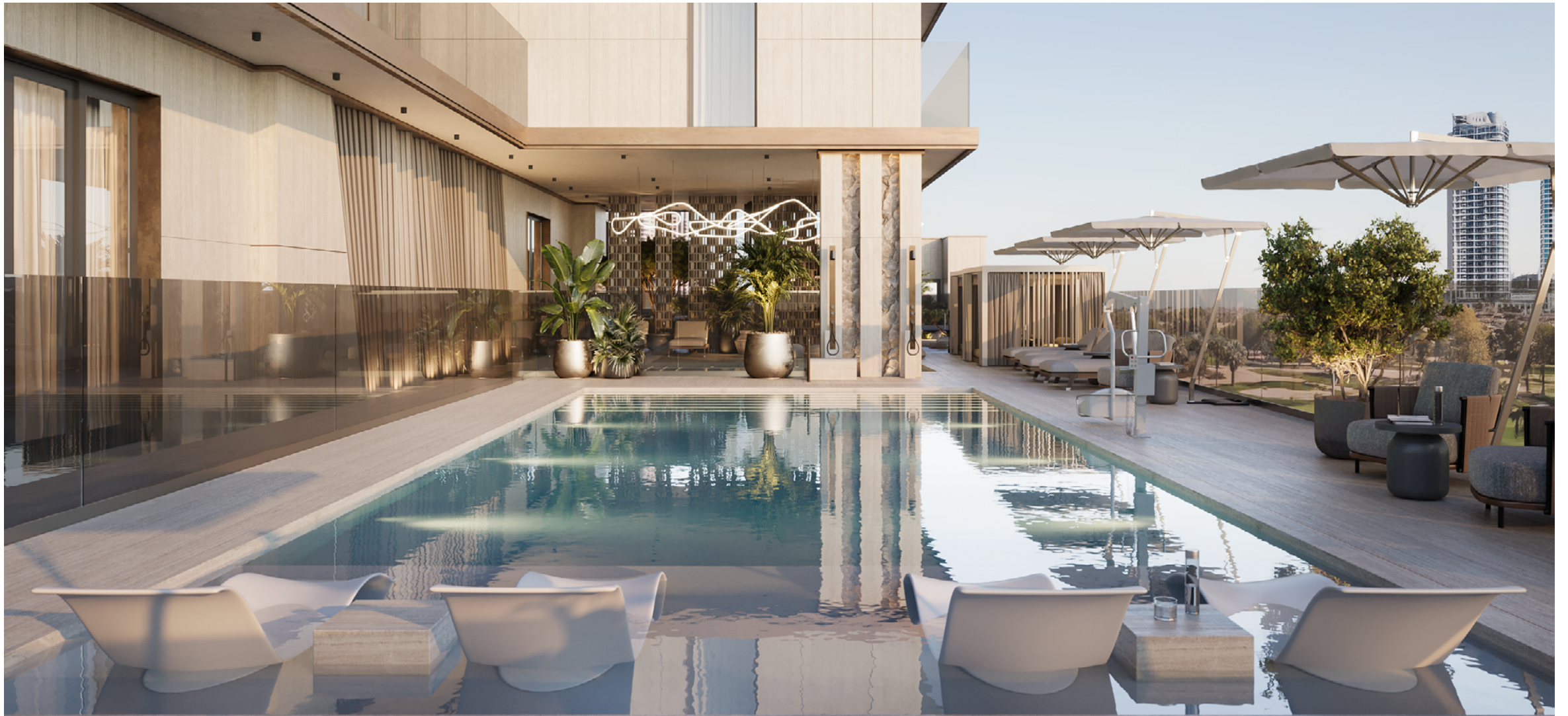
Temperature-Controlled Common Pool