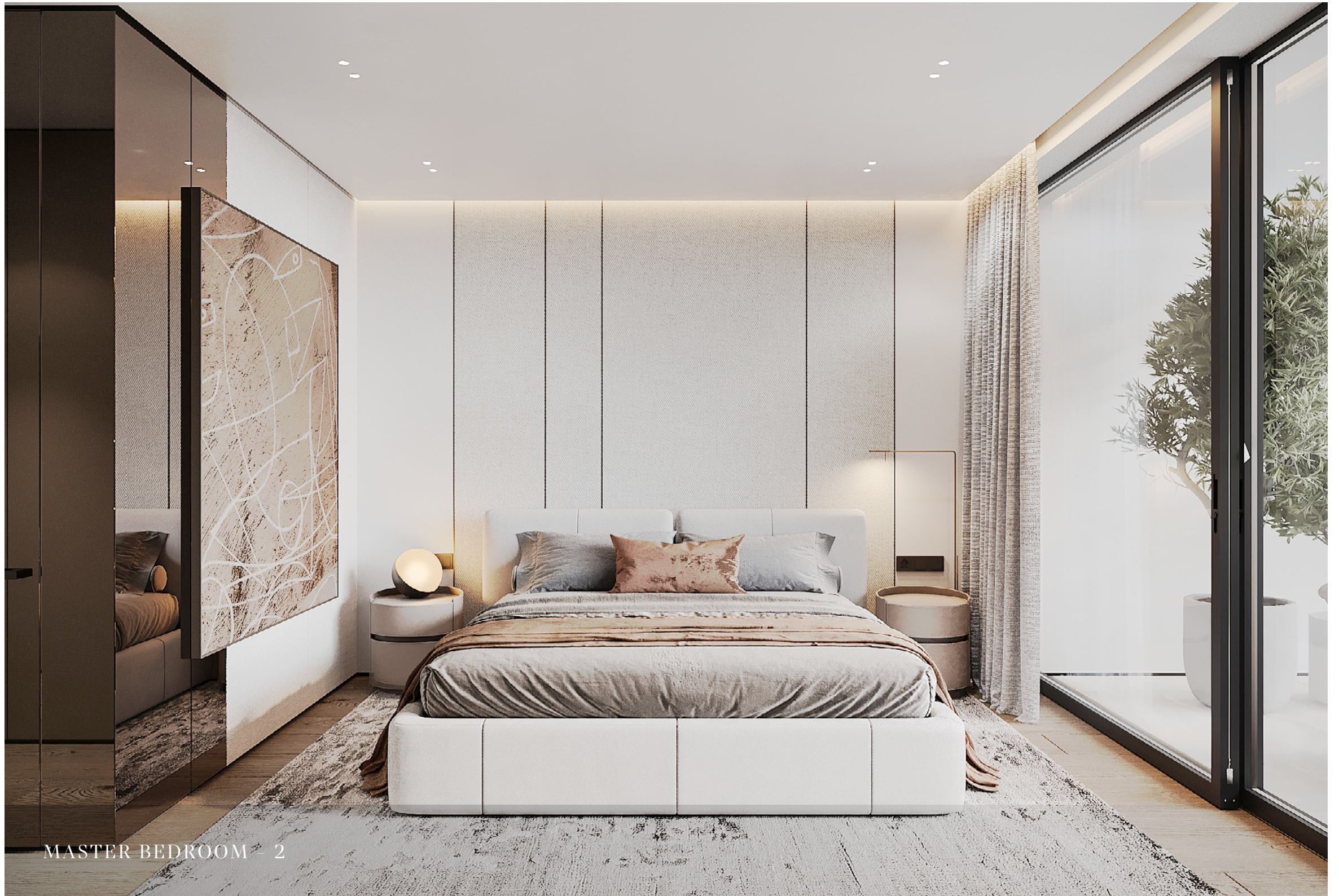
MASTER BEDROOM - 2