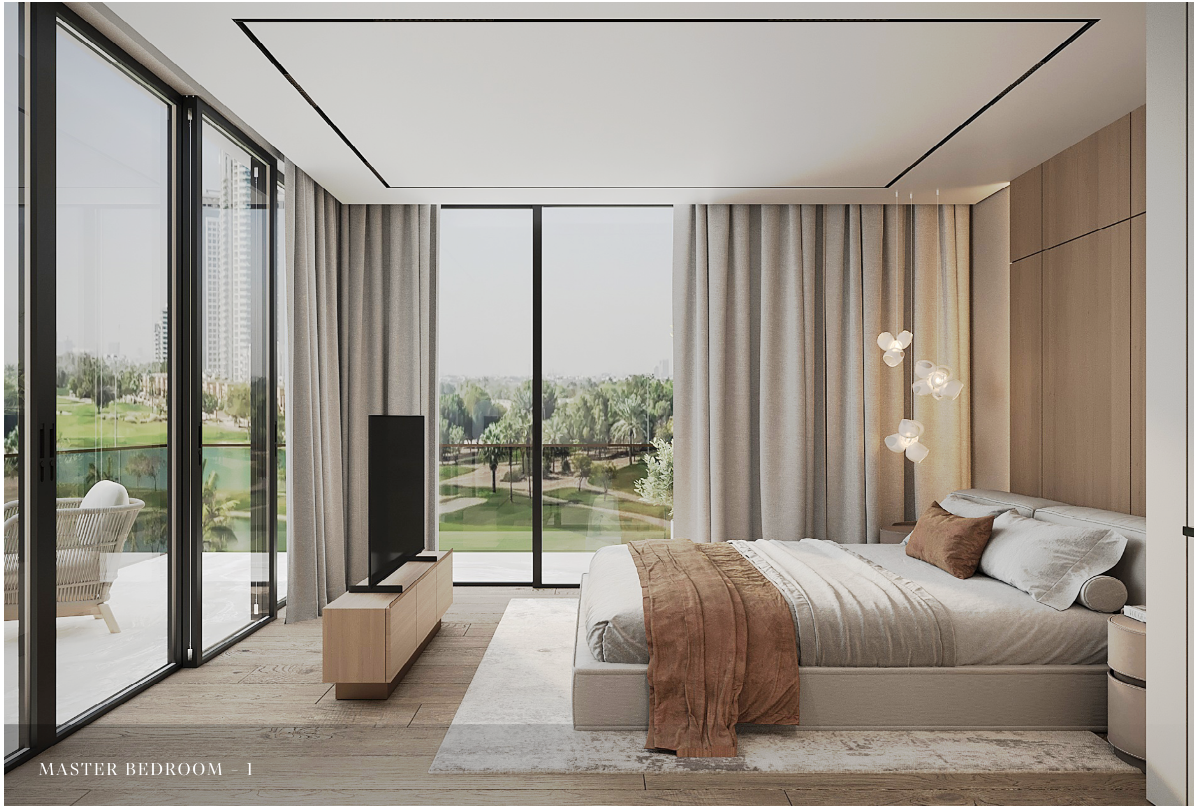
MASTER BEDROOM - 1